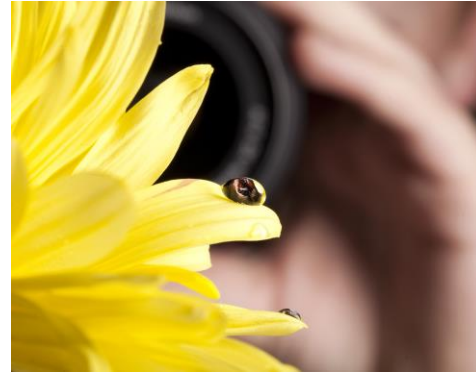
Photo must be a single print/digital image. Collages and collections of photos are not accepted. Entrant must be the photographer and may use a variety of digital editing techniques including but not limited to, multiple exposure, negative sandwich and photogram.